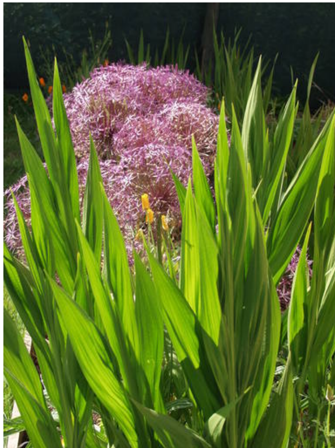
The Force that Through Green Fuse Drives