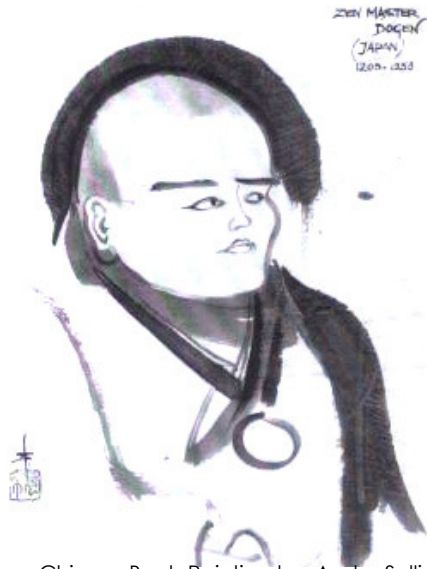
Chinese Brush Painting by: Andre Sollier

As a result of the discussions, we have drafted plans for the format and frequency of this new publication, in addition to guidelines about content. These guidelines are for members to refer to when drafting their own